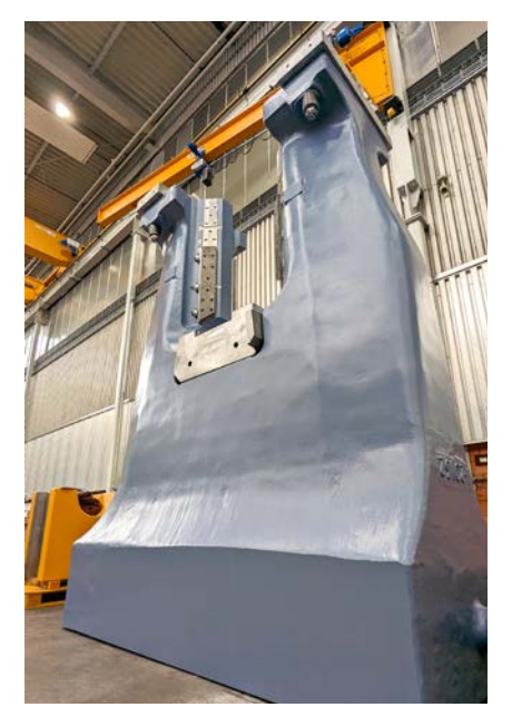
The massive U-frame of the new forming unit alone, weighing approx. 58 t, is an imposing sight.

The Pewag group is a leading global manufacturer of snow chains, forestry chains, load chains, spring chains, slings and safety chains. The group currently has annual sales of more than 250 million euros with around 1,200 employees in 120 countries.