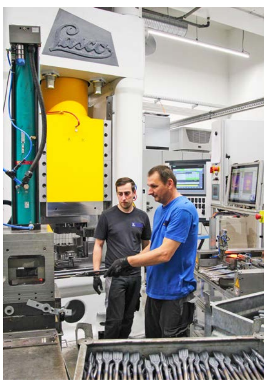
The DreBo tool factory in Althausen has been using a state-of-the-art LASCO screw press for the production of high-quality drilling tools for several months.

The planned automation generates additional productivity and efficiency gains. LASCO technology becomes part of an innovative die forging line with high repeatability, increased output and optimized sustainability aspects: Handling of the forging blanks, heating, forging/upsetting and finishing will be fully automated. According to those responsible at DreBo, there is no question that all goals will be achieved in the near future based on their experience with the LASCO SPR.